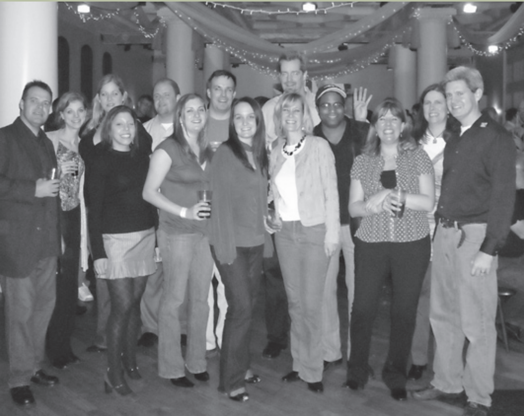
THE ASSOCIATE BOARD'S ACTIVITIES ARE INTEGRAL IN RAISING FUNDS AND FRIENDS FOR THE FREE CLINIC.

Never underestimate the power of social networking to join people in a common cause. The Free Clinic's Associate Board, comprised of a growing group of enthusiastic young professionals, has elevated this idea to a fine art. Many Associate Board members were looking for meaningful avenues to channel their energy, creativity and altruistic spirit. The Associate Board's annual Microbrew event, which has been held for the last 10 years in November, attracts hundreds of friends, and friends of friends, to listen to great music, sample a variety of microbrews, and raise money to fund services at The Free Clinic. For many, this "party with a purpose" served as the launching pad for other volunteer activities on behalf of the Clinic.